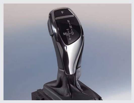
Cover made by MIM technology

As a systems supplier of component assemblies incorporating plastics, OECHSLER provides further advantages. For our customers, we can also integrate injectionmolded ceramics/metals in complex component groups by means of manual, semiand fully automatic assembly processes. As required, we can also make the precision plastic parts necessary for this purpose through other specialized IM processes such as polymer bonded magnets, IMD, multi-component technique, and inmold assembly.